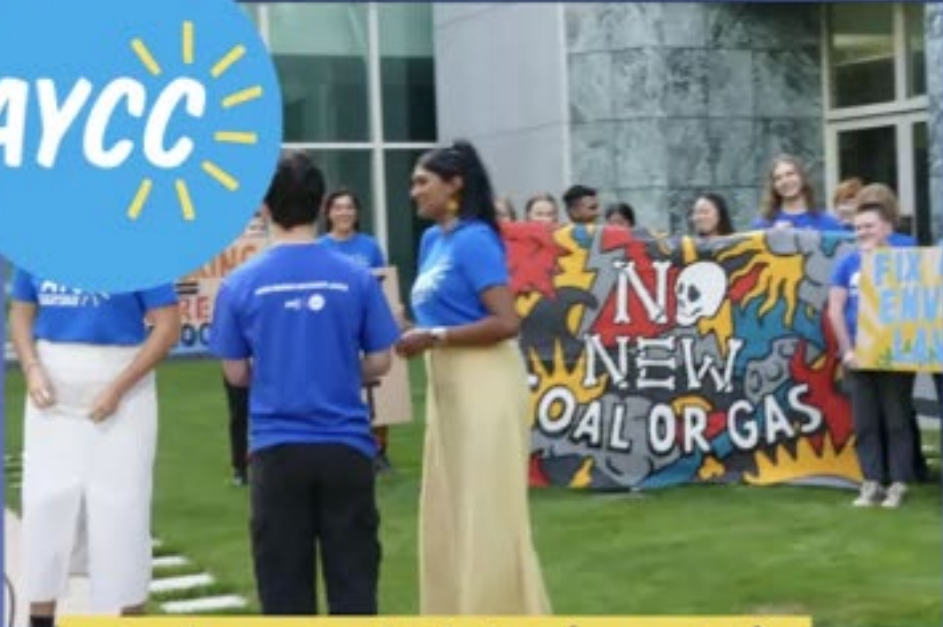
canberra lobbying trip