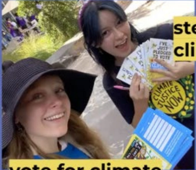
vote for climate justice