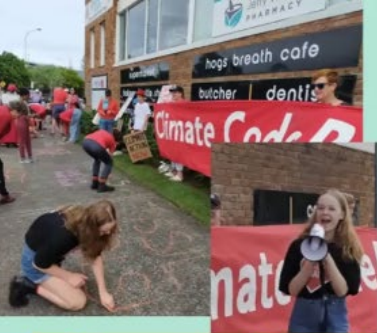
coffs council declare a climate emergency