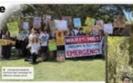
protests and strikes

School Strike 4 Climate continued its protest in Coffs Harbour on Monday, with a group of about 20 students gathered in front of the school. The students were holding signs and banners, and some were wearing red shirts. The school principal, Mr. [Name], said that the school was proud to support the students' efforts to raise awareness about climate change. He also mentioned that the school had recently implemented several sustainability initiatives, such as recycling bins and energy-saving measures. The students' actions were met with applause from the school staff and the community.